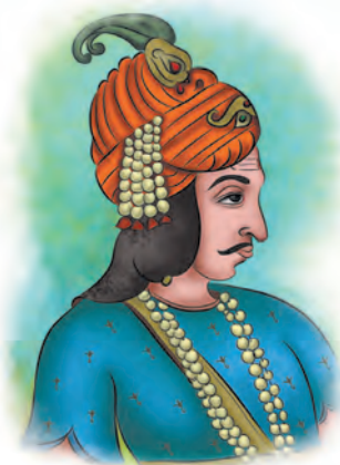
Bajirao Peshwa I

defeat but it also lowered the morale of the Marathas greatly.