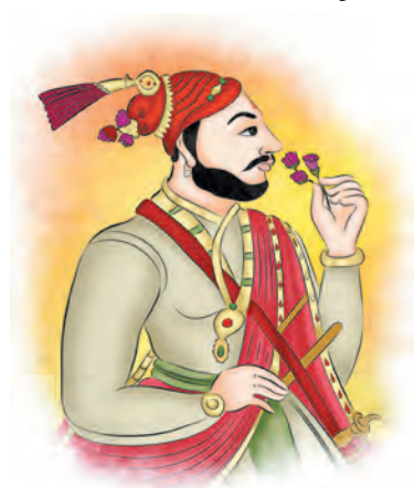
Chhatrapati Sambhaji Maharaj

After the death of Chhatrapati Shivaji Maharaj, Chhatrapati Sambhaji Maharaj was coronated as the king of Swarajya. During his reign, a constant conflict continued with the Mughal emperor Aurangzeb. Aurangzeb's rebellious son Akbar had established friendly relations with Sambhaji Maharaj. Enraged by