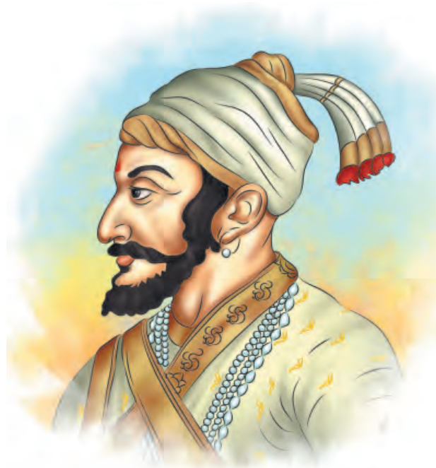
Chhatrapati Shivaji Maharaj

For Additional Information : The Mawal region is a mountaineous terrain and is not easily accessible. The vallyes at the foot of Sahyadri ranges in Maharashtra are known as 'Mawal' and the local people of Mawal are known as 'Mawalas'. The Mawalas in the army of Shivajiraje played a great role in establishing Swarajya. Shivaji Maharaj had created a feeling of trust and affection in their minds. Shivaji Maharaj set himself on the task of establishing Swarajya with the support of these Mawalas. Many of his close associates like Kanhoji Jedhe, Tanaji Malusare, Netoji Palkar, Baji Pasalkar, Baji Prabhu Deshpande, Murarbaji Deshpande etc. were from the Mawal region.