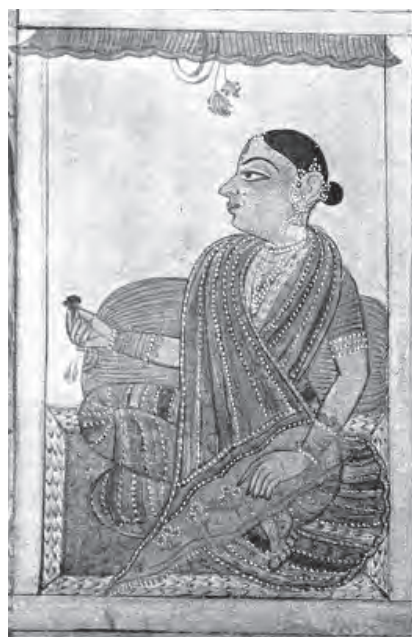
Miniature painting - Maratha period

singing of Bhajans were popular. Powadas (Ballads) were composed during this period to encourage the spirit of heroism among the people. The ballads known as 'powadas' and 'katavas', composed by the Shahirs were the types of historical poetry. The powadas