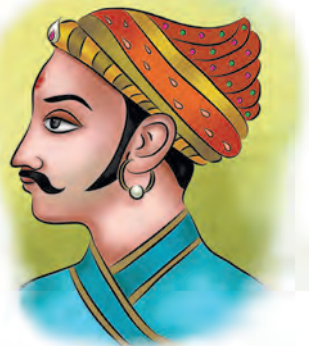
Chhatrapati Shahu Maharaj

The Mughals continued their efforts to defeat the Marathas, even after the death of Aurangzeb. For that purpose they adopted the strategy of dividing the Marathas. They released Shahu Maharaj from captivity in 1707 C.E. After his release there was a conflict between Maharani Tarabai and Shahu Maharaj. Shahu Maharaj won the ensuing battle. Balaji Vishwanath played an important role on behalf of Shahu Maharaj and later he was appointed as Peshwa.