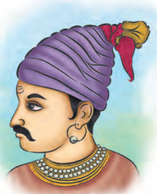
Chhatrapati Rajaram Maharaj

While leaving for Jinji, Rajaram Maharaj entrusted Ramchandrapant Amatya, Shankaraji Narayan Sachiv, Santaji Ghorpade and Dhanaji Jadhav with the responsibility of defending Raigad. The guerrilla tactics of Santaji and Dhanaji proved the large scale artillery and huge cannons of the Mughals to be of little use. Despite of holding very few assets the Marathas continued to create havoc for the Mughals. Rajaram Maharaj safeguarded Swarajya in these trying times. This was a great task in itself and a great success of Rajaram Maharaj.